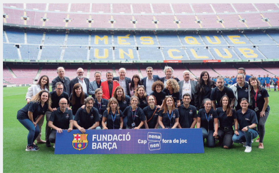
The FC Barcelona Foundation team with several board members and external collaborators.